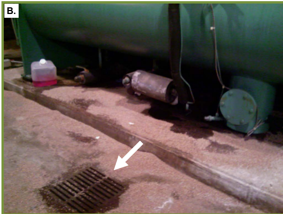
Figure 2. Outdoor (A) and indoor (B) oil storage tanks located near drains. The locations would obviously (rather than “reasonably”) be expected to direct spills to surface waters in harmful quantities.