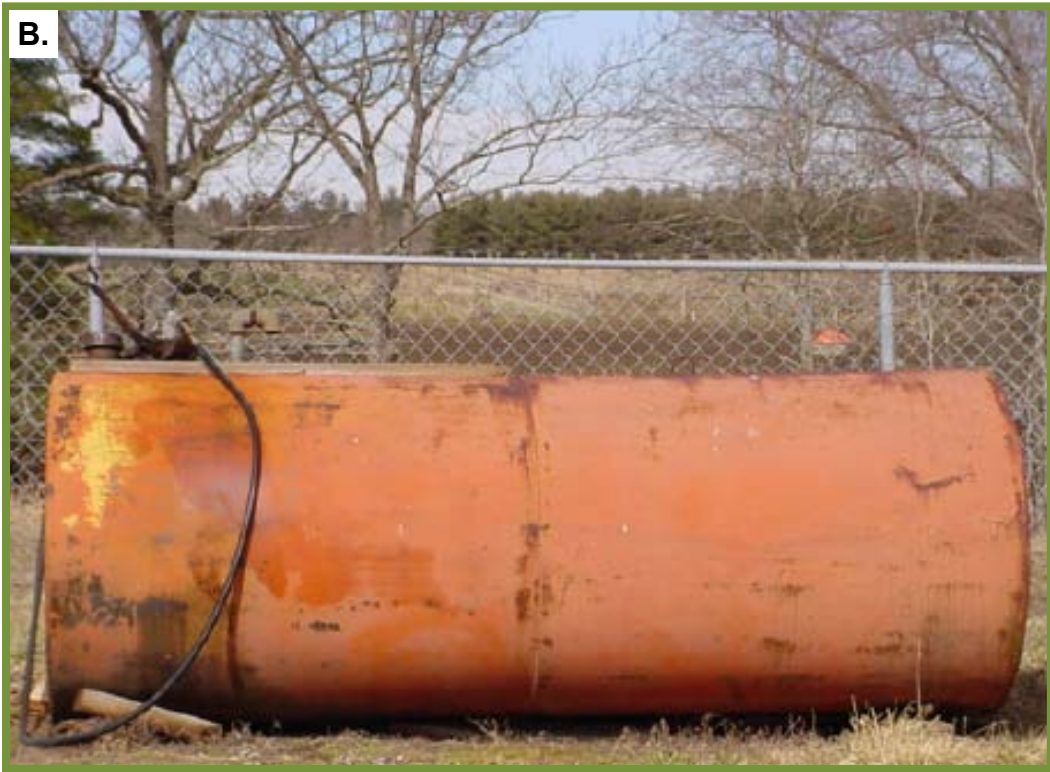
Figure 3. Outdoor oil storage tanks in locations that would obviously (rather than “reasonably”) be expected to direct spills to surface waters in harmful quantities. (A) Diesel tanks on a hill above a lake and (B) a farm diesel tank on a hill above a creek.