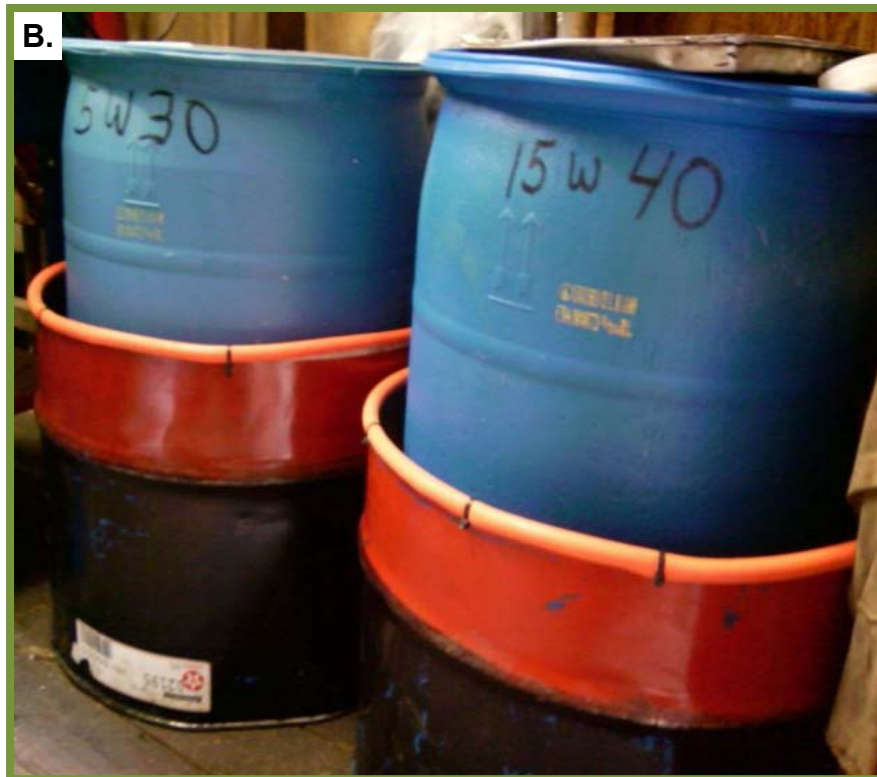
Figure 4. Examples of an outdoor (A) and indoor (B) oil storage tanks with oil spill secondary containment structures.