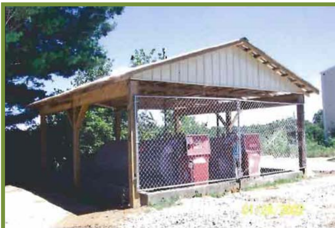
Figure 6. Gas and diesel tanks (1,000 gallons) with a roofed concrete secondary containment.

Where practical, place a roof over the tank and secondary containment so that rainfall does not accumulate within the structure ( Figure 6 ). Although a roof will represent an expense and something else to maintain on your farm, it will eliminate the hassle of managing accumulated water that could otherwise corrode the tank and tank supports. If your secondary containment is equipped with a drain, the