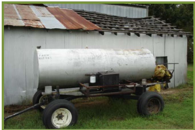
Figure 5. An on-farm diesel fuel nurse tank.

Farm nurse tanks ( Figure 5 ) do not require dedicated secondary containment but must be positioned to prevent a discharge (e.g., away from ditches).